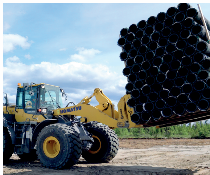
Transporting the large amount of Advanced Enviro))Septic pipes needed for this project

The effluent of the septic tank is pumped into six different interlaced cells. Each cell is fed by the same pumping station. This pump distributes wastewater evenly into the 21 rows of Advanced Enviro))Septic pipes found in each cell. The proper functioning of the System O)) depends on a uniform distribution of wastewater between the Advanced Enviro))Septic pipe rows. This is achieved with the help of equalizers installed inside the distribution box. These equalizers have weirs that are manually adjusted by a dial during the installation. They are the only moveable parts in the entire system. Once they are set during the installation, they don't need to be adjusted again. The treated effluent of the system is discharged into the ground.