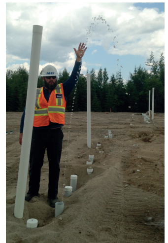
A low pressure distribution system