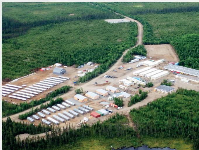
Aerial view of the site

Treatment results available upon request.